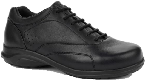
Leela CW003 BK