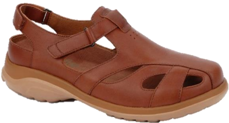
Zoey CW009 BR