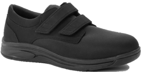
Casey UC001 BK

Our Grasp™ Outsole is Lightweight & Durable