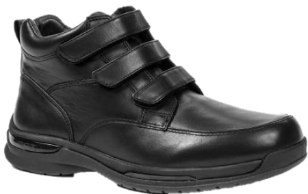
Jackson H&L CM012 BK