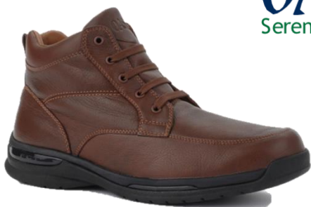
Jackson CM007 BR

Even our most lightweight styles include full-length midsole cushioning, composite shanks, and reinforced counters.