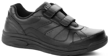
Tyler H&LUA001 BK