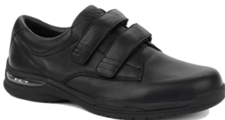
Nevis H&L CM002 BK