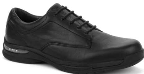
Nevis CM001 BK